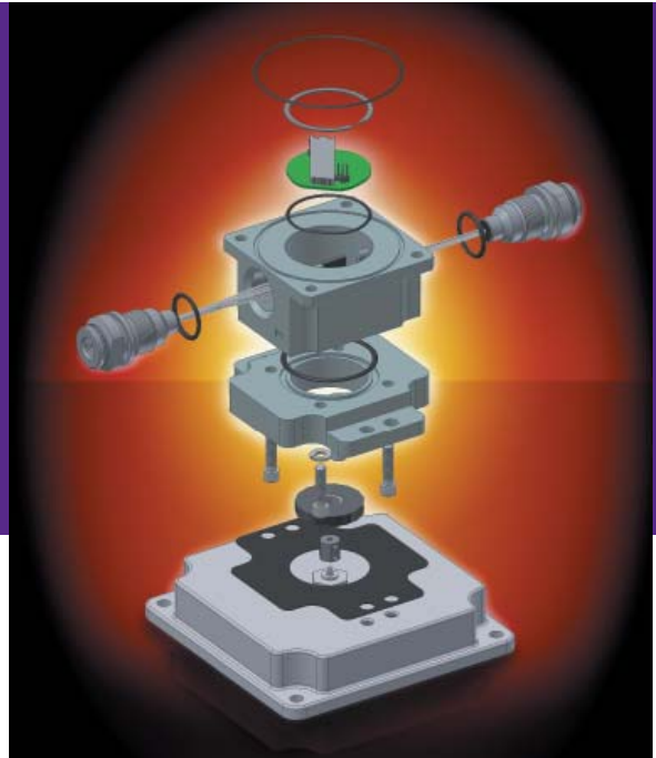
FloBoss 104 Sensor Assembly and Rotary Interface

The FloBoss™ 104 is a compact, high-performance flow computer that is cost effective for fiscal measurement. It performs API 21.1 compliant flow measurement when used with pulse-generating devices, such as rotary, turbine, and ultrasonic meters. The FloBoss 104 shares its advanced technology platform with the FloBoss 103, its orifice metering twin.